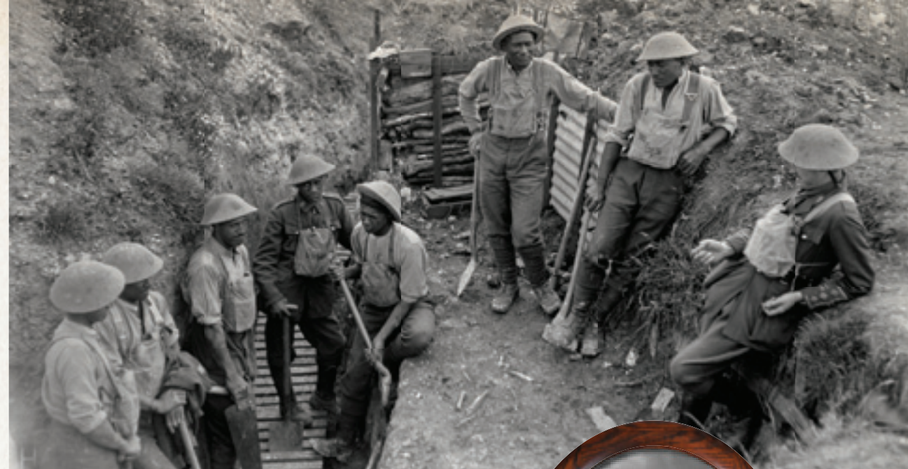
Soldiers in the Māori Pioneer Battalion taking a break in the trenches, France, July 1918

Around the middle of 1917, the Pioneer Battalion was reorganised. The Otago men were replaced with around 470 soldiers, mostly from Niue and the Cook Islands. The battalion became known as the New Zealand (Māori) Pioneer Battalion.