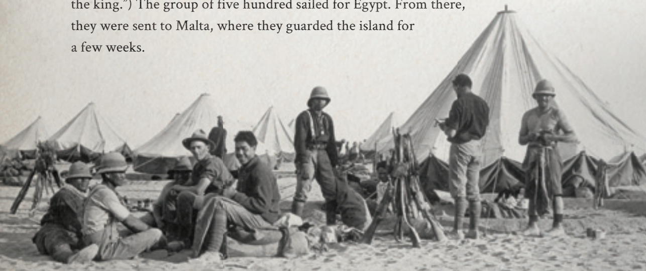
Māori soldiers at Zeitoun Camp in Egypt

The Māori Contingent became known as Te Hokowhitu-a-Tū. In February 1915, after training in Auckland, the soldiers were farewelled. “Haere e tama ma,” their whānau said. “Haere me te whakaaro ki te pupuri i te rongou toa a o tatou tipuna. Kia wehi ki te Atua. Whakahonoretia te kingi.” (“Farewell, young men. Go and uphold the name of our warrior ancestors. Fear God. And honour the king.”) The group of five hundred sailed for Egypt. From there, they were sent to Malta, where they guarded the island for a few weeks.