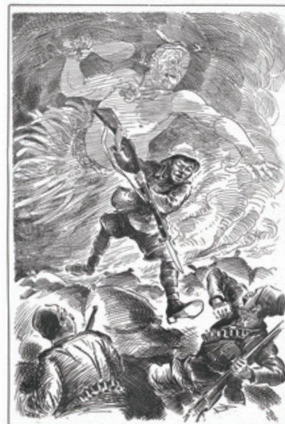
THE SPIRIT OF HIS FATHERS.

At first, conscription was only for Pākehā. In June 1917, it was extended to Māori – but only those living in the Waikato, where very few Māori men had volunteered because most didn’t support the Crown. However, the policy failed. By 1918, over a hundred Waikato Māori had been sent to prison for refusing military training, and there were warrants out for the arrest of a hundred more. In the end, only a handful of Waikato Māori ever made it into uniform.