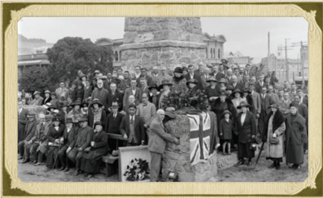
Placing soil from the battlefields of Belgium in the Whanganui Māori War Memorial on Anzac Day, 1925