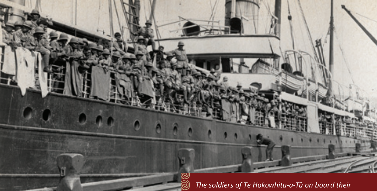
The soldiers of Te Hokowhitu-a-Tū on board their troopship just before leaving, February 1915